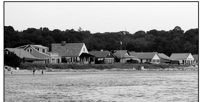
West Meadow Beach.