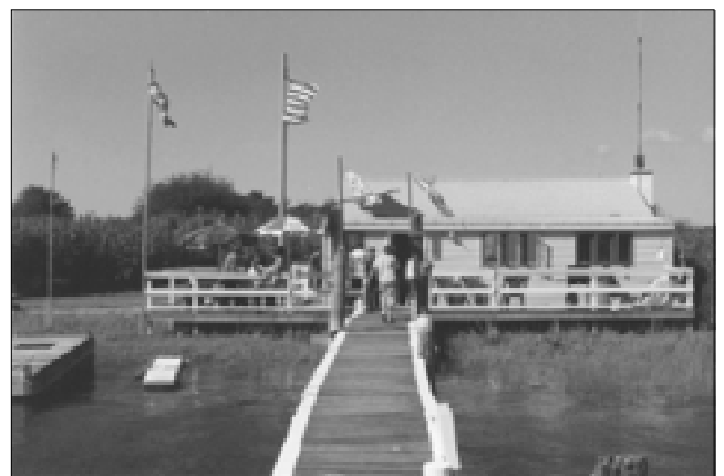
Remsen's bay house