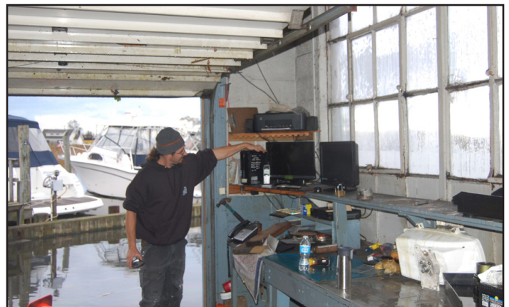
"We went from being six feet under water to within days having equipment and trucks running."

Superstorm Sandy flooded all of Davison's buildings, swept boats off their stanchions, and damaged small and large vessels alike. "In the winter we were trying to figure out how to fix everyone and get them out boating again. One thing we didn't do was to set the anchor off in the canal and tighten it up, so as the tide came up it would pull the boat away from the dock. That would have proved to help us out – but we missed that on this storm. But having the buildings saved us." ■