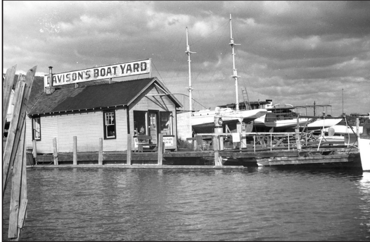
"The shanty" in the mid-1940s.