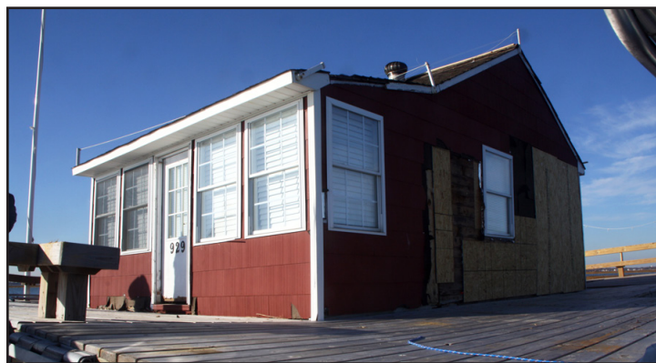
The Pidherney bay house will be among those featured on the 2013 bay house tour. The house was severely damaged by Superstorm Sandy.

Tickets for the bay house tours are $50 for adults, $90/couple with a $5 discount for LI Traditions members. ■