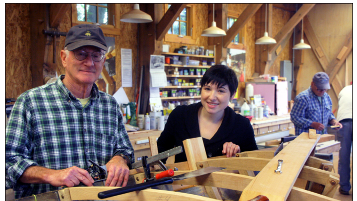
The Bayles Boat Yard in Port Jefferson will be featured in the Shore to Shore exhibit at the Gold Coast Library.